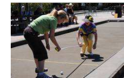
Bocce Ball, game of precision