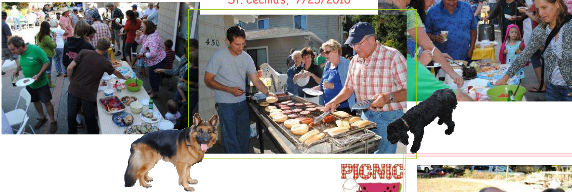
Summer Picnic at St. Cecilia's, 7/25/2010

This is a powerful story of weighing one's life against the time and energy one puts into this world in parallel to the eternal life to come, and how do those scales balance. It seemed Christ enjoyed the life of this world, he drank, partied and played. He had fun, but he also enjoyed the life of the soul and of the spirit. The balance made him a complete man, as it does for any man or woman.