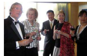
5 o'clock cocktail hour sharing stories of the day