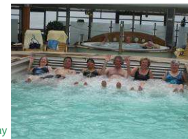
Relaxing in the spa