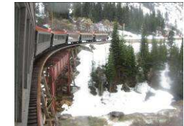
Skagway's White Pass & Yukon Railway