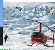
Spike & Emy's Helicopter Glacier Trek