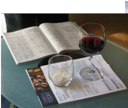
Celebrating Mass on board

Everyone has their own self understanding of who someone else is. Be it positive or negative, confused or bemused, serious or silly, academic or athletic, and so on. Jesus gave us his description of who he is. Have we understood the manifestation of his being?