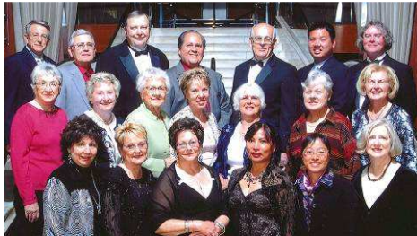
St. Cecilia & St. Mary Alaska Cruise, May 10 - May 21, 2010