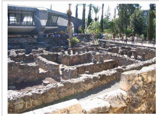
Saint Peter's Home in Capernaum

Peter's home on the shores of the Sea of Galilee, in the village of Capernaum. Maybe it was the first parish of christianity. Certainly the first seat of church power as Peter is the first pope. I wonder how many discussions, Gospel talks, liturgies, parish activities took place from this house.