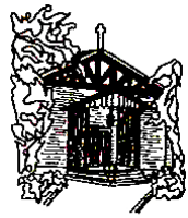
st. cecilia church lagunitas